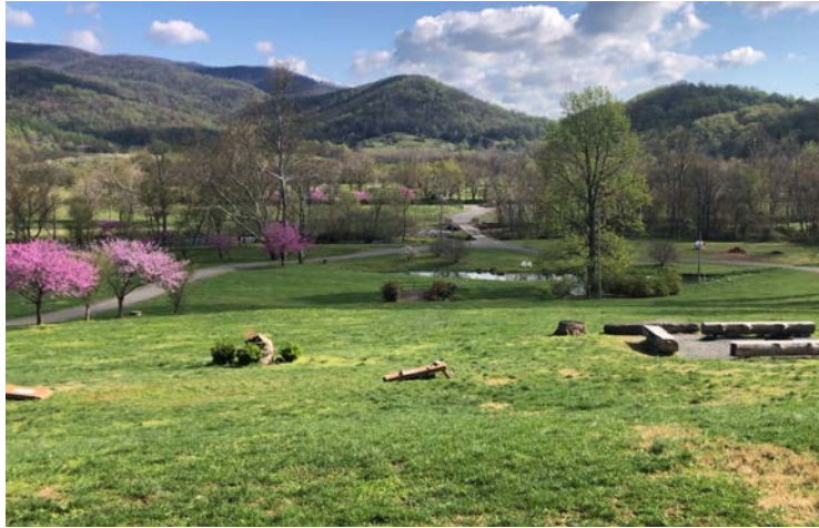
April view from Graves Mountain Lodge, Syria, VA.