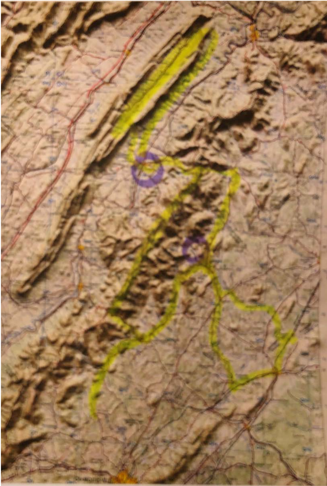
The FORT VALLEY is at the top in yellow, blue circle just below is town of LURAY, and the other blue circle is SYRIA. Day routes are shown in yellow.