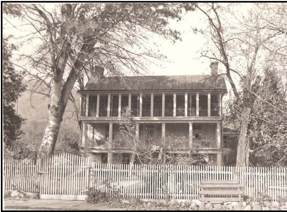
The Graves family's 1857 'new ordinary' on the property and still their family homeplace.